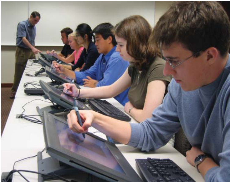
Figure 3. Interactive Pen Display

This section summarizes the pen-based computing hardware that supported our deployment in order to set the context for the evaluation in Section 4. Currently the most popular type of pen-based computing device is the Tablet PC (a pen-enabled laptop). A related device is the interactive pen display which can be attached to a standard desktop computer in place of a traditional monitor. Interactive pen displays are essentially LCD displays that the user can write on with a special pen. Finally, a graphics tablet is an inexpensive (often less than $100) USB device that attaches to a standard laptop or desktop computer. The user can draw on the graphics tablet with a special pen but must look at the computer display to see the drawn content.