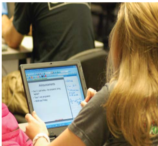
Figure 2. DyKnow Collaborative Note Taking Interface

algorithm. The original tree and newly added value would be displayed on each student's computer. The teacher could then ask the students to add several additional values to the tree; each student could add these values directly to the diagram that the teacher had supplied.